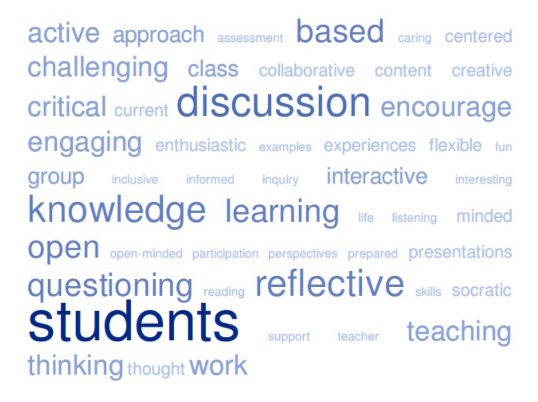
Figure 1. Word frequency display of the codes for teaching philosophy.

challenging to interpret such as "No failure - just a new learning experience". The responses were coded. Some phrases could be coded as more than one category. For example, phrases such as "recognizing alternative views" and "devil's advocate" and "often the obvious is wrong" were coded as both 'open' and 'questioning'. The most frequent descriptors of teaching philosophy were: discussion based, student-focused, reflective, connections/ grounded in real life situations, exploration, collaborative, challenging, questioning/ question assumptions, critical/analysis, open-minded, adaptive, student-led, current, open (exercising all points of view but with valid arguments), flexible.