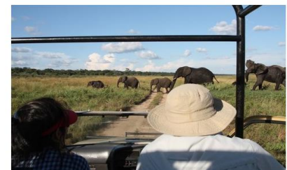
Encountering elephants in Zimbabwe's Hwange National Park. Nicholas Kristof

It's summer. So my Sunday column is a bit unusual and offers some travel advice: The "coolest places on Earth," as I see them. I'm sure some of you disagree with my choices, so post your thoughts below—and include your own recommendations for off-the-beaten path choices for others to take up.