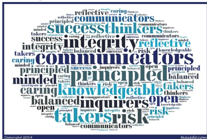
Figure 3. Bald's word cloud. This figure illustrates Bald's interpretation of the IB Learner Profile.