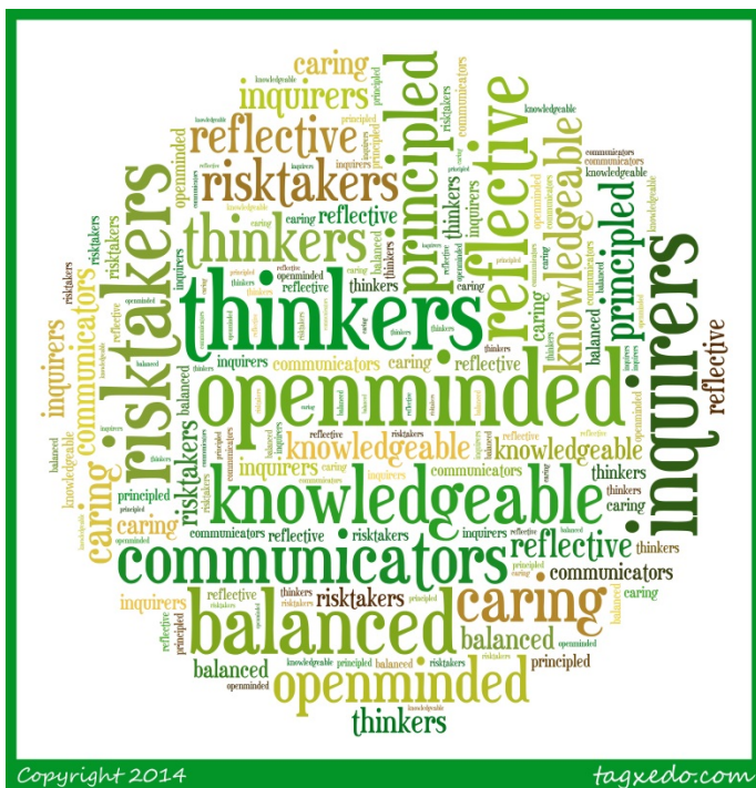
Figure 5. Trish's word cloud. This figure illustrates Trish's interpretation of the IB Learner Profile.