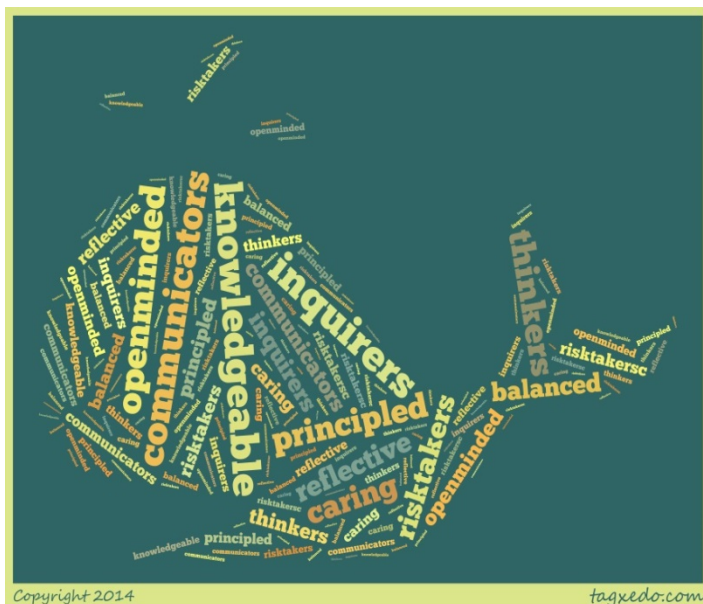
Figure 6. Geology Rocks' word cloud. This figure illustrates Geology Rocks' interpretation of the IB Learner Profile.