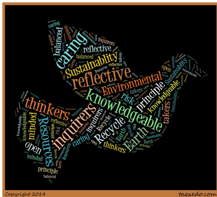
Figure 4. Earthling's word cloud. This figure illustrates Earthling's interpretation of the IB Learner Profile.

“What are they going to do with that? How are they going to use that to be better members of society? So I try to incorporate these terms into lessons, using them when I'm teaching the kids. How can this look in real life? How can you be a risk taker in real life? What you do to show that you care for somebody? Because I think that's ultimately what we do.”