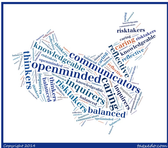
Figure 6. Casey's word cloud. This figure illustrates Casey's interpretation of the IB Learner Profile.